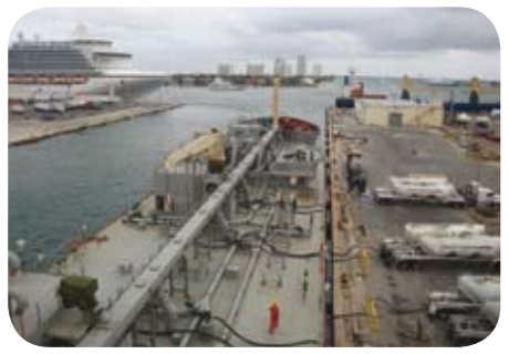
Cement loading in Port Everglades (above), floating terminal in Almirante (right)

the UBC Cartagena arrived in February 2010. Both vessels were chartered from United Bulk Carriers which is a division of Intership Navigation in Cyprus. The broker for both time charters was R G Jones Price. The vessels are brand new and came directly from the shipyard in China. They have a cargo capacity of about 7800t. The vessels have each been fitted with 14 truckloading connections and in this way can be loaded at about 4000tpd. The vessels are fitted with a 600tph MacGregor (formerly Nordströms) mechanical/pneumatic discharge system from Cargotec Sweden, Marine Selfunloaders business line.