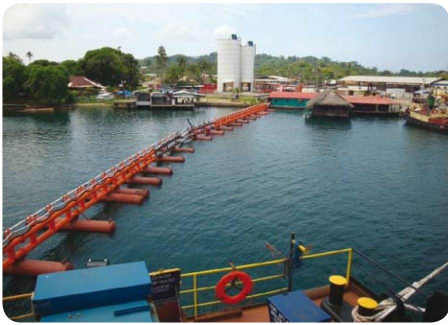
Floating pipeline to silos (above), floating terminal (above right), pneumatic discharge of floating terminal (far right), Indian canoe close to floating terminal (right)

two visits the whole conversion was made at anchor. 'Lavioletta' has a storage capacity of 23,000t divided over five holds. In empty condition her draught is about 2.5m. Fully-loaded, her draught is about 8.8m. With a length of 150m, a width of 23m and a depth of 12m she is the largest vessel in Almirante and quite a presence there. In September 2009, she was towed from Limon to Almirante and put into her operating position. By lowering the spudpoles of the vessel she has been firmly fixed into position.