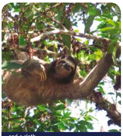
...and a sloth

project, an insight into the complicated logistics behind it and how these logistics resulted in the solutions for the complete cement and fly ash supply chain.