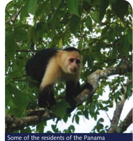
some of the residents of the Panam rainforest .... a capuchin monkey

supply chain had to be set up involving overseas sourcing of cement and fly ash, sea transportation, the construction of a complete terminal facility and trucking of the cement and fly ash from the terminal to the storage facility at the site. In the first phase of the project the cement and fly ash had to be transported in big bags. This is a very comprehensive supply system and a highly interesting one as well! This article offers a description of the